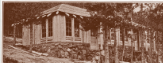
One of the Numerous Sleeping Cabins (14 boys and 2 leaders)