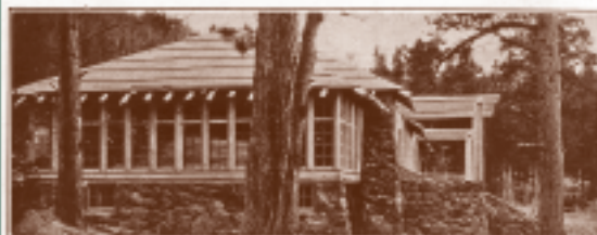
The Hospital at Sky-Hi – Almost an Invitation to be Sick