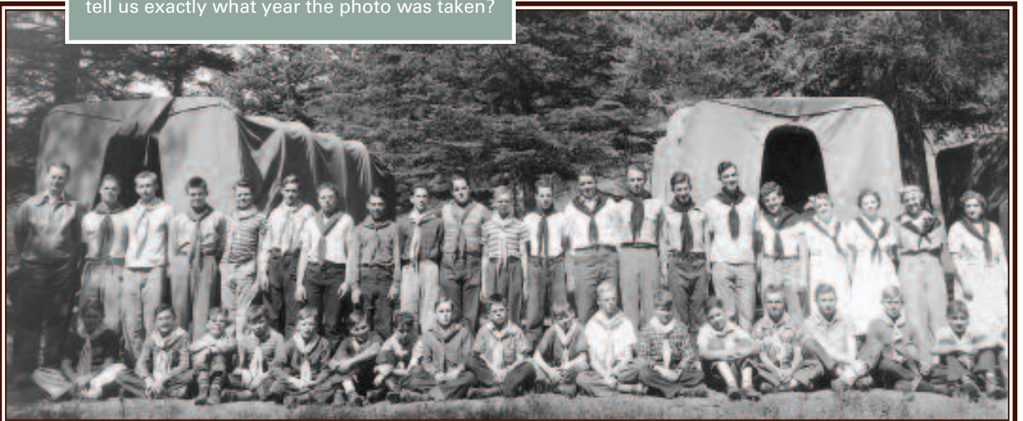
Photo of Boys' Trail's End staff and campers taken prior to the early 60s (old wagons were replaced about 1963). Do you recognize yourself or any relatives ( ! ! ) and can you tell us exactly what year the photo was taken?